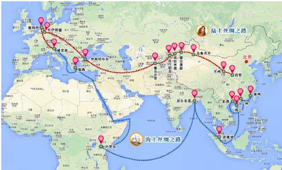
Figure 1. 'One Belt and One Road' in the Action Plan (National Development & Reform Commission, 2015).

Belt and Road' (National Development & Reform Commission, 2015). The list thus covers a continuous span of a large part of the whole Euro-Asian continent, plus Egypt. 3 However, as more countries in Africa and Latin America, which are geographically non-contiguous with the Euro-Asian continent, signed official collaboration deals with China, the original unofficial 65-country list no longer made sense. Indeed, for its connotation of a finite number of countries 'along' a fixed 'belt and road', official sources never used this concept of 65-country. In official sources, Xi's statement at the 2017 Belt and Road Forum in Beijing further emphasized that the BRI 'focuses on the Asian, European and African continents, but is also open to all other countries. All countries from either Asia, Europe, Africa or the Americas, can be international cooperation partners of the Belt and Road Initiative' (Xi, 2017). Such expanding scale of geographic coverage of the BRI further illustrates the open, flexible, but also vague nature of the spatial vision underlying the BRI, which may go even beyond the Euro-Asian continent.